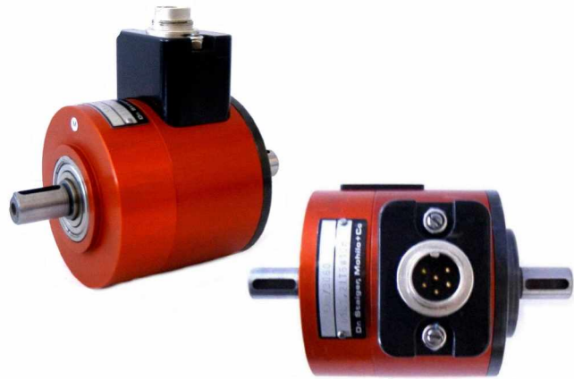
Torque transducer type IT / model W

The applications are labs, manufacturing and quality control.