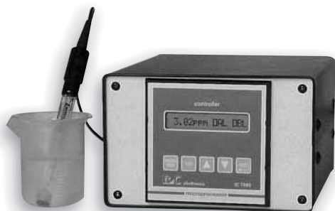
Example of applications

Add the following to the common Features/Specifications of the 7685 Series shown overleaf